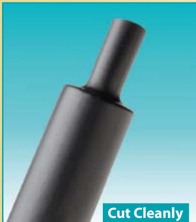
Cut Cleanly Scissor