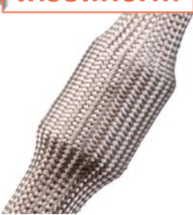
Insultherm Ultraflexx Pro expands up to 50% for easy installation