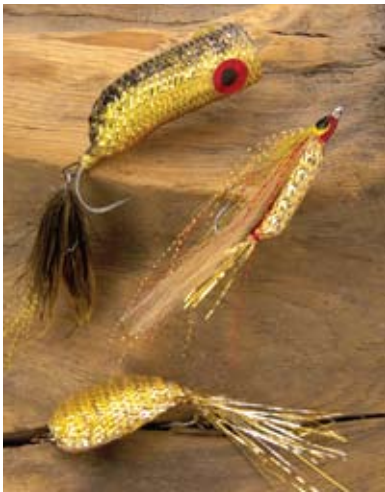
Light weight and economy make MY an ideal product for designing and tying fishing lures of all types and sizes. Several world records have been set with lures constructed with Techflex sleeving.