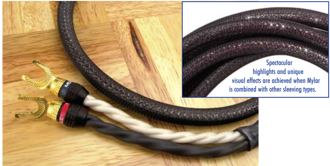
Spectacular highlights and unique visual effects are achieved when Mylar is combined with other sleeving types.