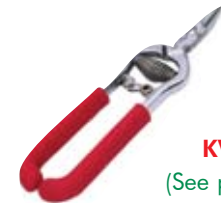
Kevlar Shears KVS0.00SV (See pg. 73)