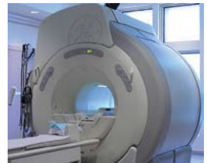
Vectran's molecular structure not only makes it one of the world's strongest materials but vectran is also invisible in MRI systems.

Vectran® is a registered trademark of the Kuraray Co., LTD.