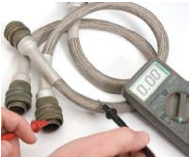
Flexo Shield can provide end-to-end shielding solution on your application.