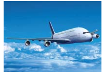
Accepted for use by major aircraft manufacturers.