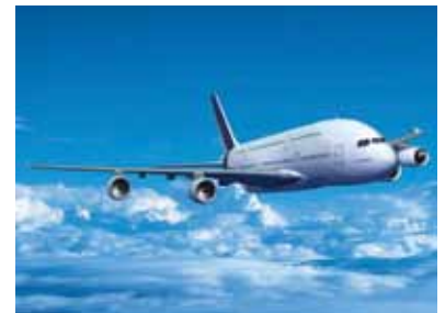
Accepted for use by major aircraft manufacturers.