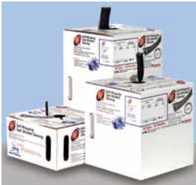
F6 is available in self storing boxes.

F6 will bend to a tight radius without distorting or splitting open and, unlike full rigid tubing, will not impair or affect the flexibility of harnesses. Allows for addition or removal of wires without disassembly.