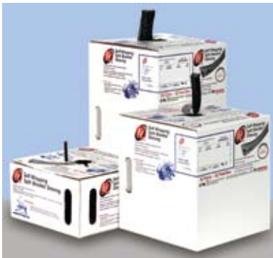
F6 is available in self storing boxes.

F6 will bend to a tight radius without distorting or splitting open and, unlike full rigid tubing, will not impair or affect the flexibility of harnesses. Allows for addition or removal of wires without disassembly.