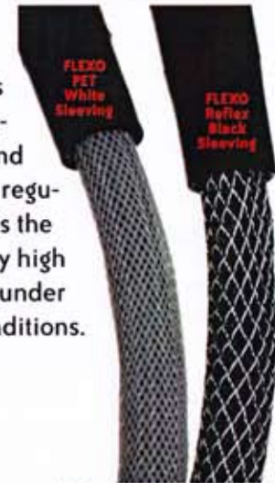
Under low light conditions, the reflective strands in FLEXO Reflex sleeving reflect light up to 1,500 times more efficiently than bright white sleeving.

FLEXO Reflex shares the same high resistance to chemicals and harsh conditions as regular PET, and provides the extra security of very high visibility at night or under adverse lighting conditions.